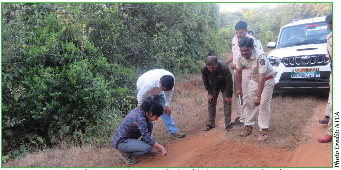
Inspection of PIP- Supervisory visit of Sahyadri Tiger Reserve, Maharashtra