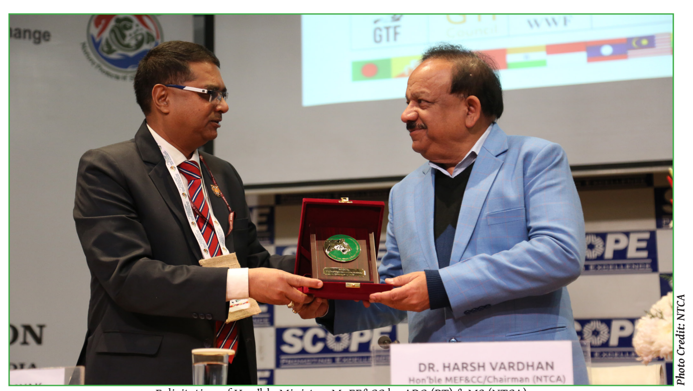
Felicitation of Hon'ble Minister, MoEF&CC by ADG (PT) & MS (NTCA)

Therefore, TRCs should prioritise sites with greatest recovery potential and focus efforts in key sites to get them to a minimal level of protection and management.