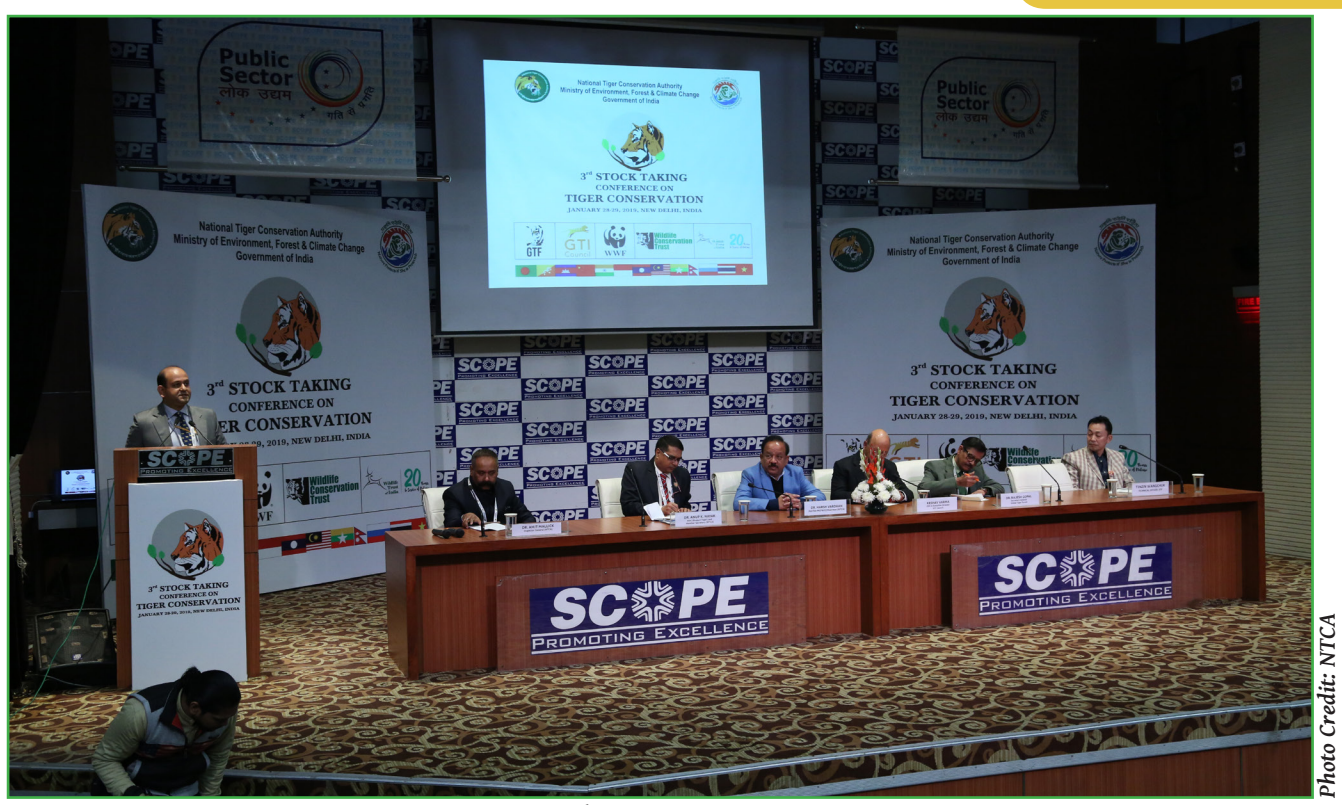
Session in progress during the 3<sup>rd</sup> Stocktaking conference on tiger conservation