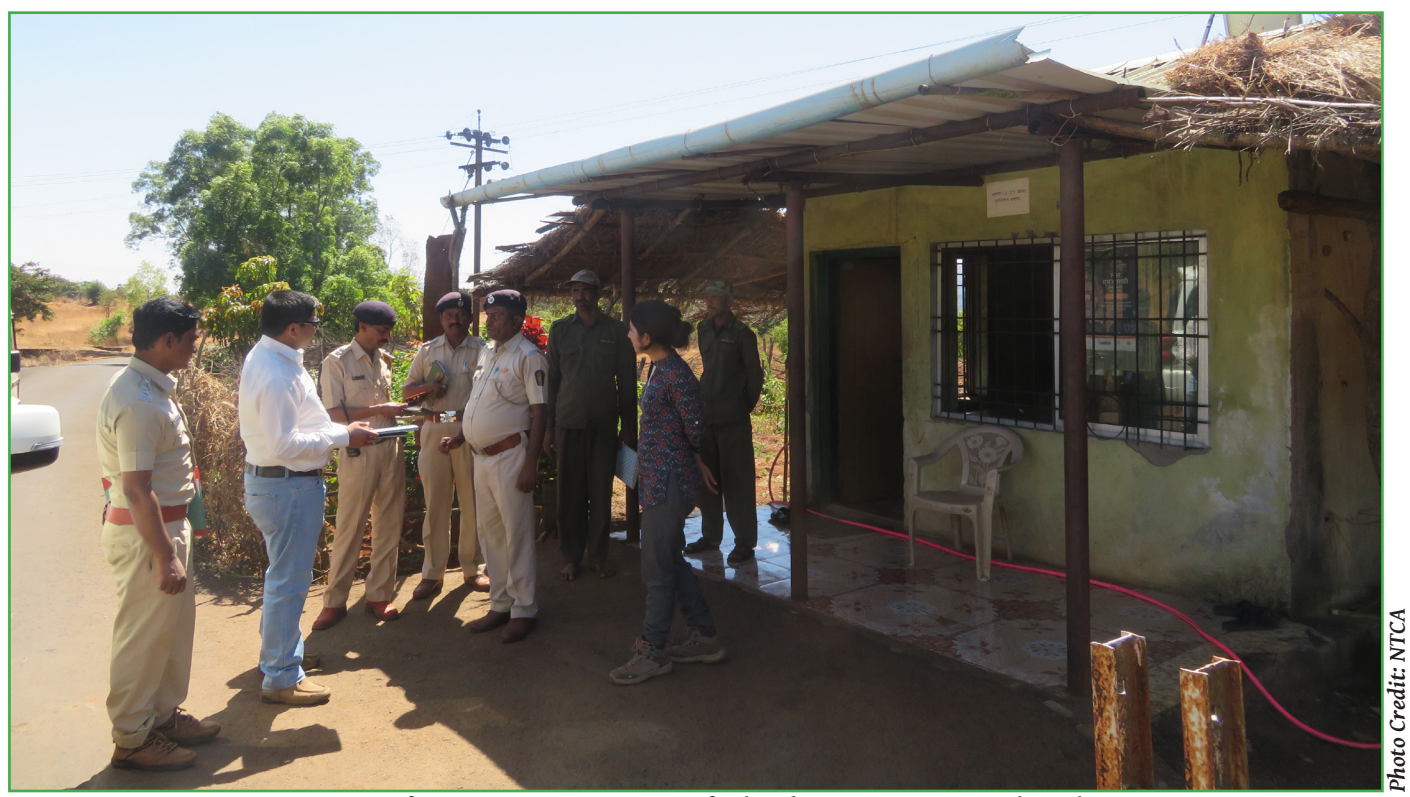
Inspection of Camp - Supervisory visit of Sahyadri Tiger Reserve, Maharashtra