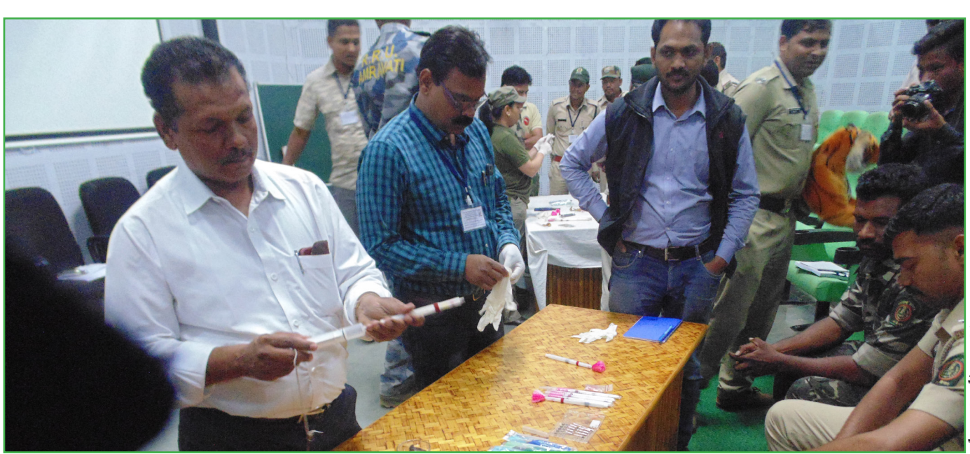
Hands on training of field staff in ToT, at Pench Tiger Reserve, Maharashtra