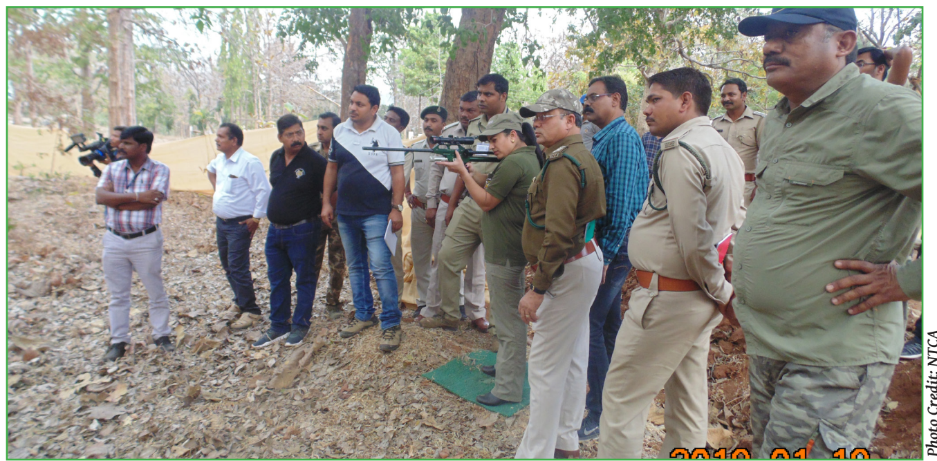
Hands on training of equipments for veterinarians in ToT, at Pench Tiger Reserve, Maharashtra

TRAINING OF TRAINERS (ToT): CAPACITY BUILDING WORKSHOP ON IMMOBILIZATION, RESTRAINT, RESCUE AND REHABILITATION OF TIGER (21-23 FEBRUARY, 2019; PENCH TIGER RESERVE, MAHARASHTRA)