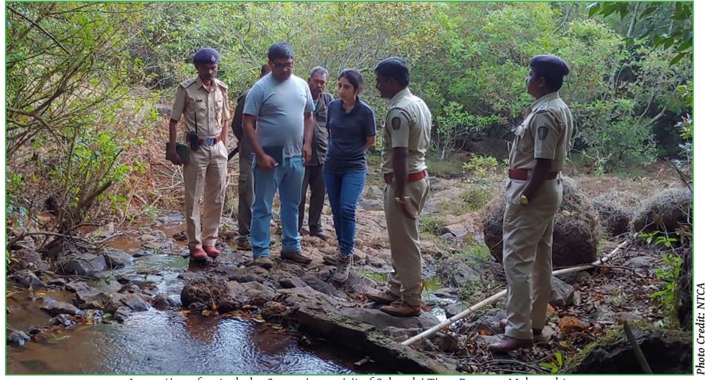
Inspection of waterhole- Supervisory visit of Sahyadri Tiger Reserve, Maharashtra

January - March 2019 www.projecttiger.nic.in 17