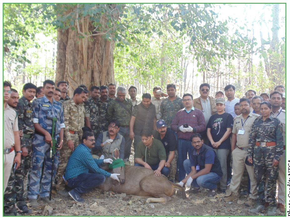
Monitoring and revival of tranquilised female Sambhar for ToT

Human wildlife conflict and its mitigation with special reference to large felids- case studies of Maharashtra: