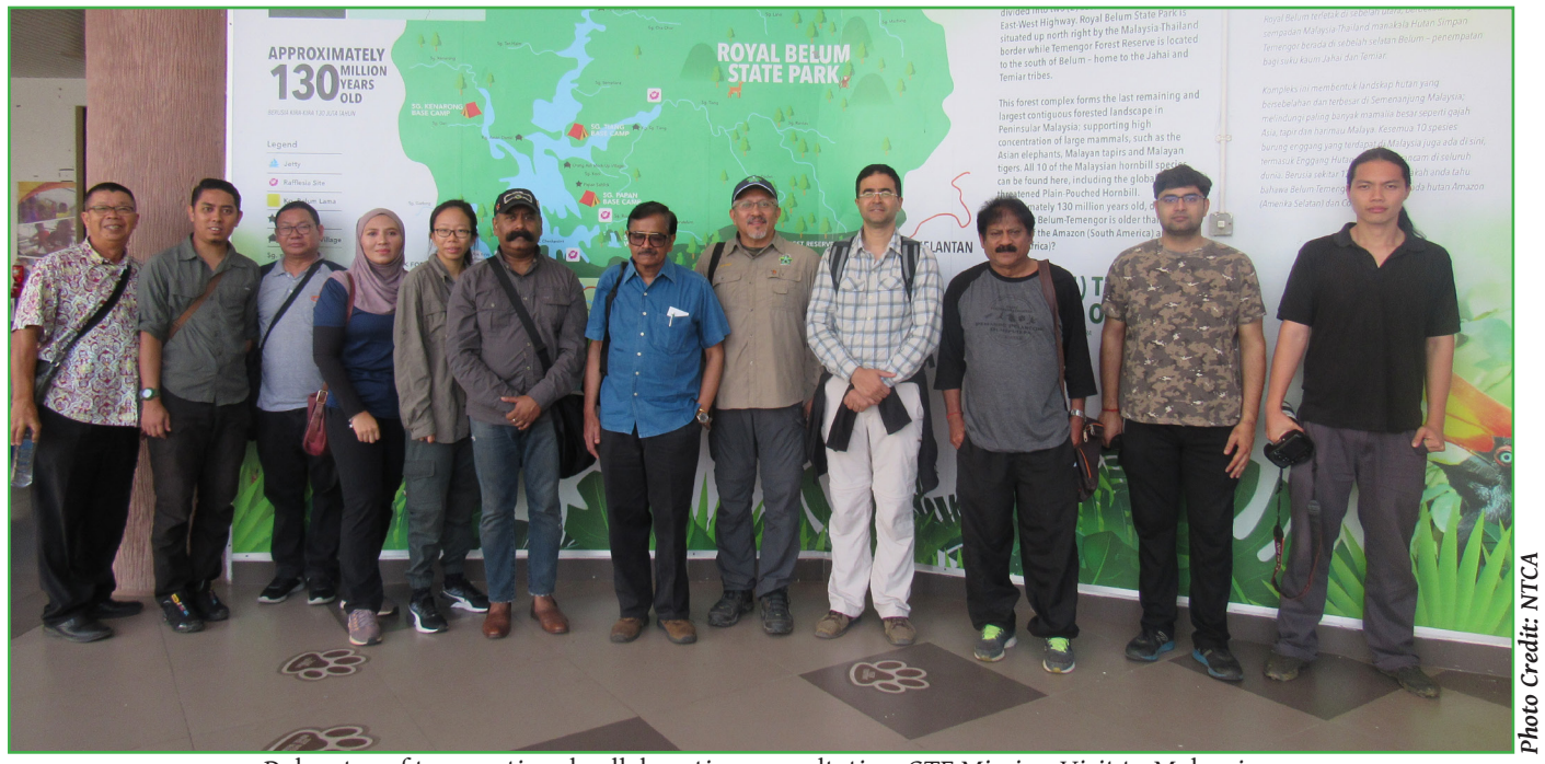
Delegates of transnational collaborative consultation-GTF Mission Visit to Malaysia