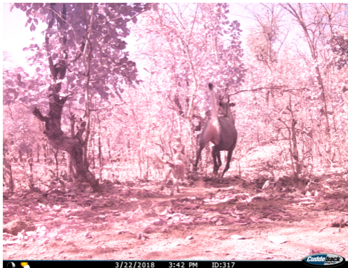
Camera trap images of stray dogs chasing sambar inside tiger reserve