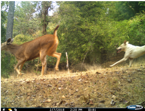
Camera trap images of stray dogs chasing sambar inside tiger reserve