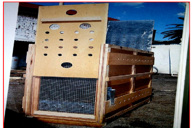
A CAGE ON THE SAID SCHEME