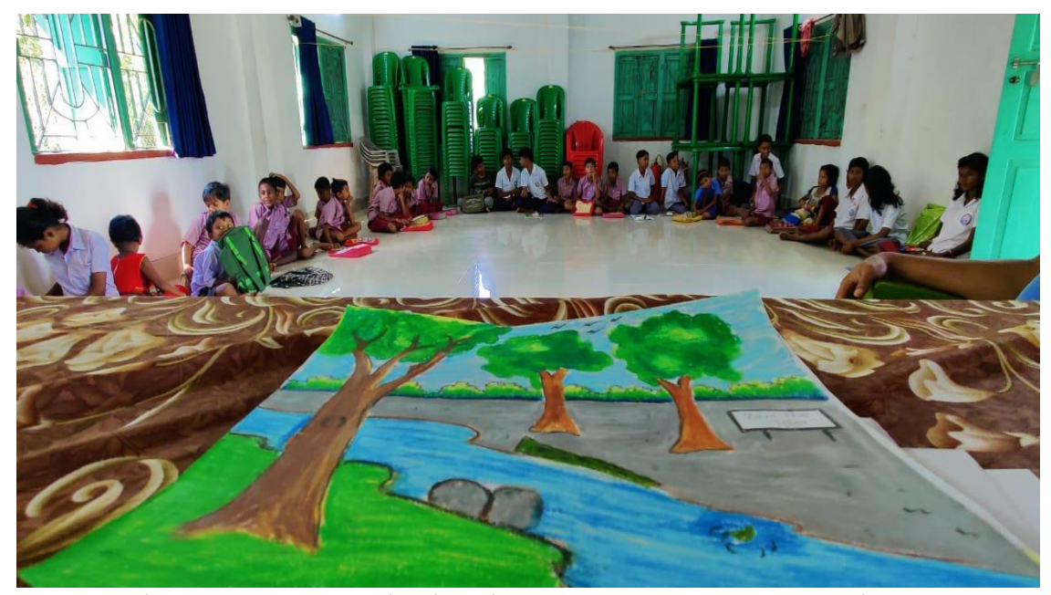
Pench Tiger Reserve - School students participating in a outreach activities

Awareness and Outreach activities to promote tiger conservation: NTCA has planned to link a total of 750 schools/ colleges/ Universities with tiger reserves to participate in various awareness and outreach activities over a period of 75 weeks. 51 tiger reserves have organized activities such as street plays, debates, painting/ drawing competitions, quiz, documentary/ film shows, plantation drives and webinars for school and college students. Besides these, rallies and visits to tiger reserves have also been organised to promote the conservation of tigers and to also sensitize young generations on diverse topics related to environment, forests and climate change. A total number of 9895 students have been sensitized till date across 18 tiger range states.