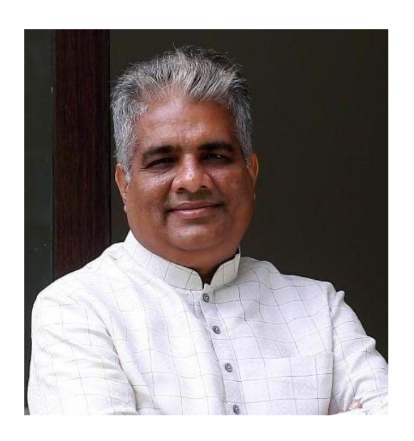
Shri Bhupender Yadav

Hon'ble Union Minister Ministry of Environment, Forest & Climate Change Government of India