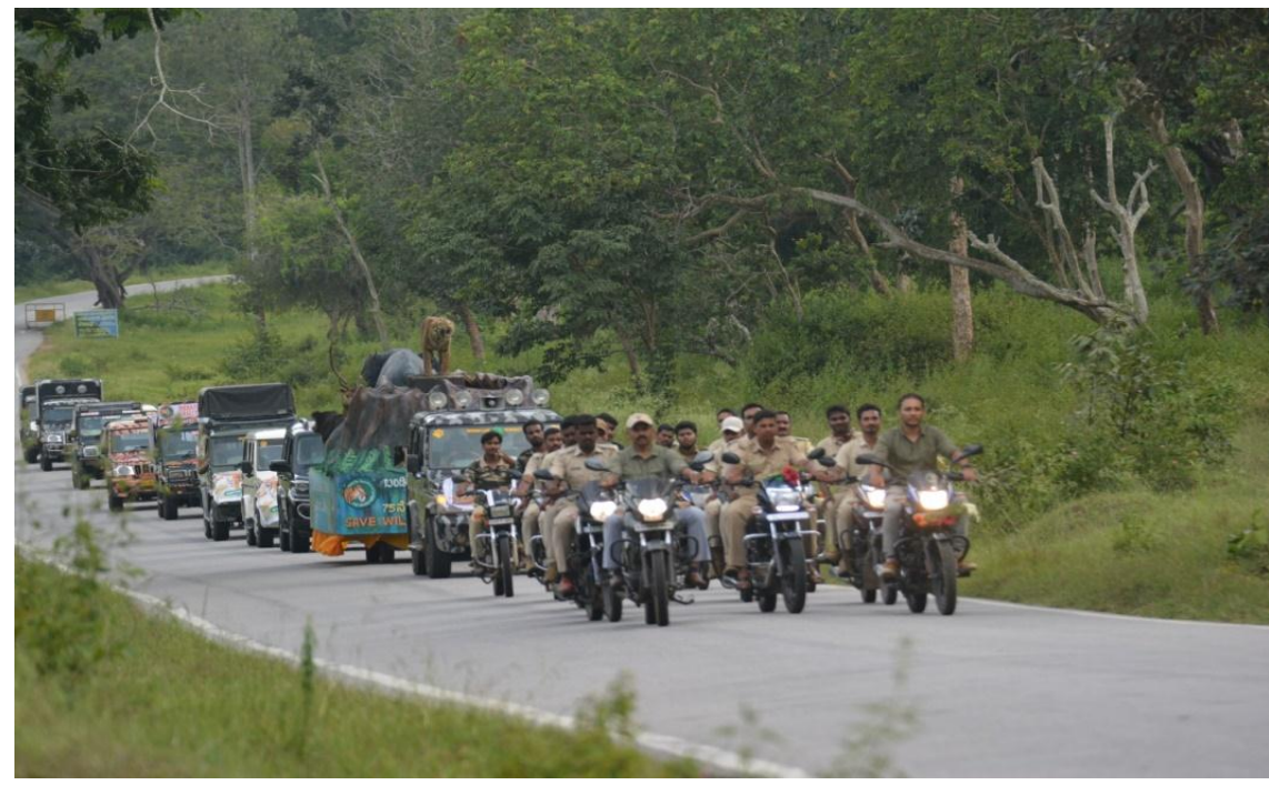
India for Tigers-A Rally on Wheels in Bandipur Tiger Reserve

Synchronized Pan India Protection Patrol in Tiger Reserves: A synchronized pan India Protection Patrol drive of 75,000 km across 51 tiger reserves has been planned under the aegis of 'Azadi ka Amrit Mahotsav' with the purpose to unite the field formations towards achieving the goal of wildlife conservation. Foot patrolling is ongoing in 18 tiger range states across the country. Total distance of ~218123 km has been covered till date with participation of 34551 forest frontline force.