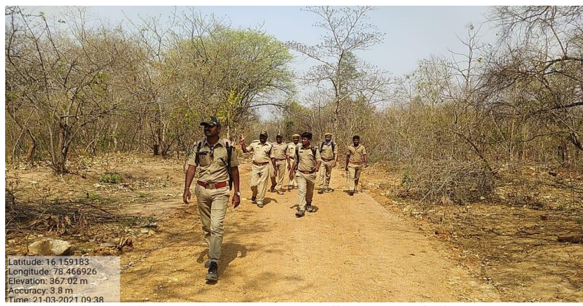
Synchronized PAN India protection patrolling in Amrabad Tiger Reserve

Synchronized Pan India Protection Patrol in Tiger Reserves: A synchronized pan India Protection Patrol drive of 75,000 km across 51 tiger reserves has been planned under the aegis of 'Azadi ka Amrit Mahotsav' with the purpose to unite the field formations towards achieving the goal of wildlife conservation. Foot patrolling is ongoing in 18 tiger range states across the country. Total distance of ~218123 km has been covered till date with participation of 34551 forest frontline force.